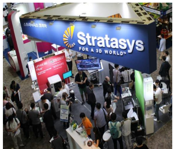
< Space Only >