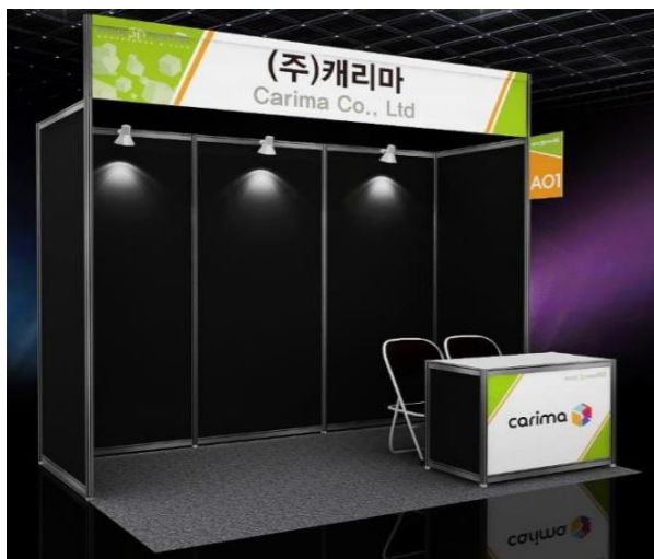
< Shell Scheme – TYPE 3 >