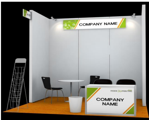
< Shell Scheme – TYPE 1 >